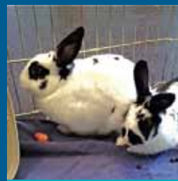
DORA & DIEGO